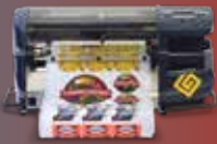
Gerber enVision™ Series Plotters