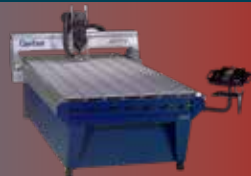
Gerber Sabre® Routers