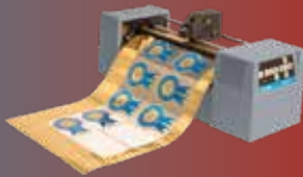
Gerber GS Series Plotters