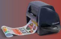
GERBER EDGE Series Thermal Transfer Printers